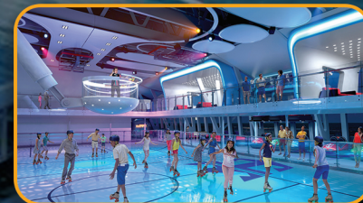
FLOATING DJ STATION